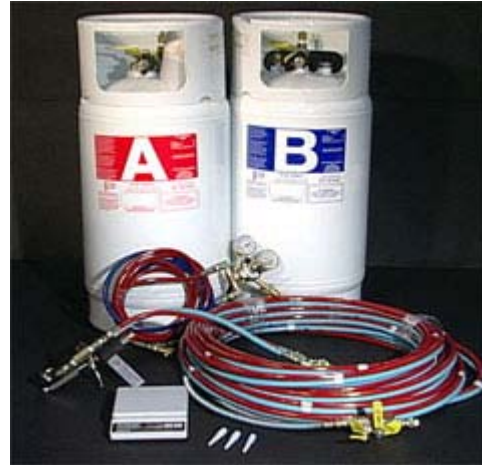
Figure 1: Two-component SPF Adhesive in pressurized cylinders.

Packaging of Single Component SPF Adhesive: Cans or cylinders in volumes ranging between 1 and 5 gallons.