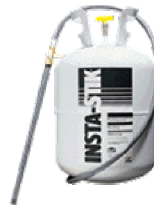
Figure 2: Single-component SPF Adhesive in pressurized cylinder.