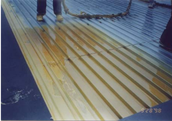
Figure 3: SPF Adhesive full coverage application.