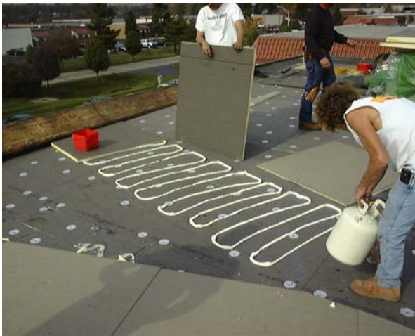
Figure 4: SPF Adhesive ribbon application.