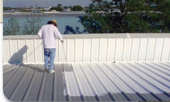
▲ Acrylic coating applied in a tropical climate.

Whatever your roofing needs, whatever your roofing problems, EnduraTech™ is the roofing solution you've been looking for. EnduraTech offers four distinct roofing systems, each designed to address specific concerns: